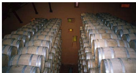
Climate Controlled Barrel Aging

Located in the heart of Westchester County, we are a Winemaking School where friends, families and business colleagues learn about wine through informative and entertaining seminars, followed by hands-on winemaking sessions in our 5,100 square foot climate-controlled facility .